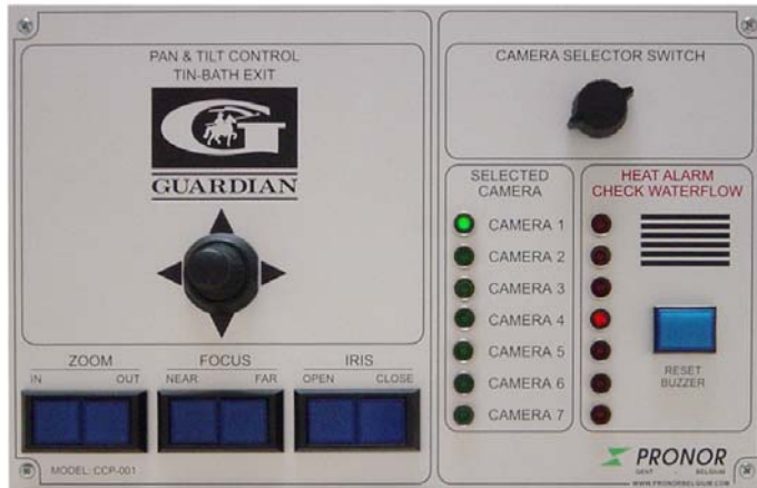
Model CCP- 001 Tin bath camera control unit (Right side panel. Left side panel will have same layout.)