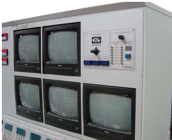
Example of Installation of water-cooled camera control panels and video monitors.