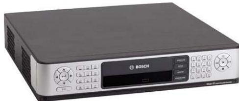
Model DIVAR-16/XF (Model DIVAR-8/XF will have the same outline.)