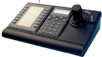
Model KBD-DIGITAL Remote digital control panel.