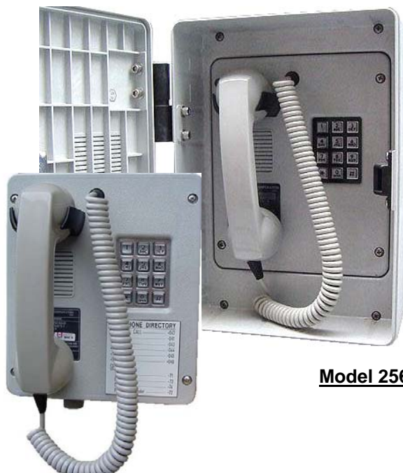
Model 256-001 Weatherproof telephone