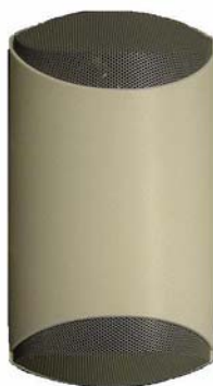
Model CP66-8 (T)