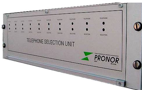
Model TELPA-DIG/RA 19"rack (Max. 10 TELPA-DIG cards)